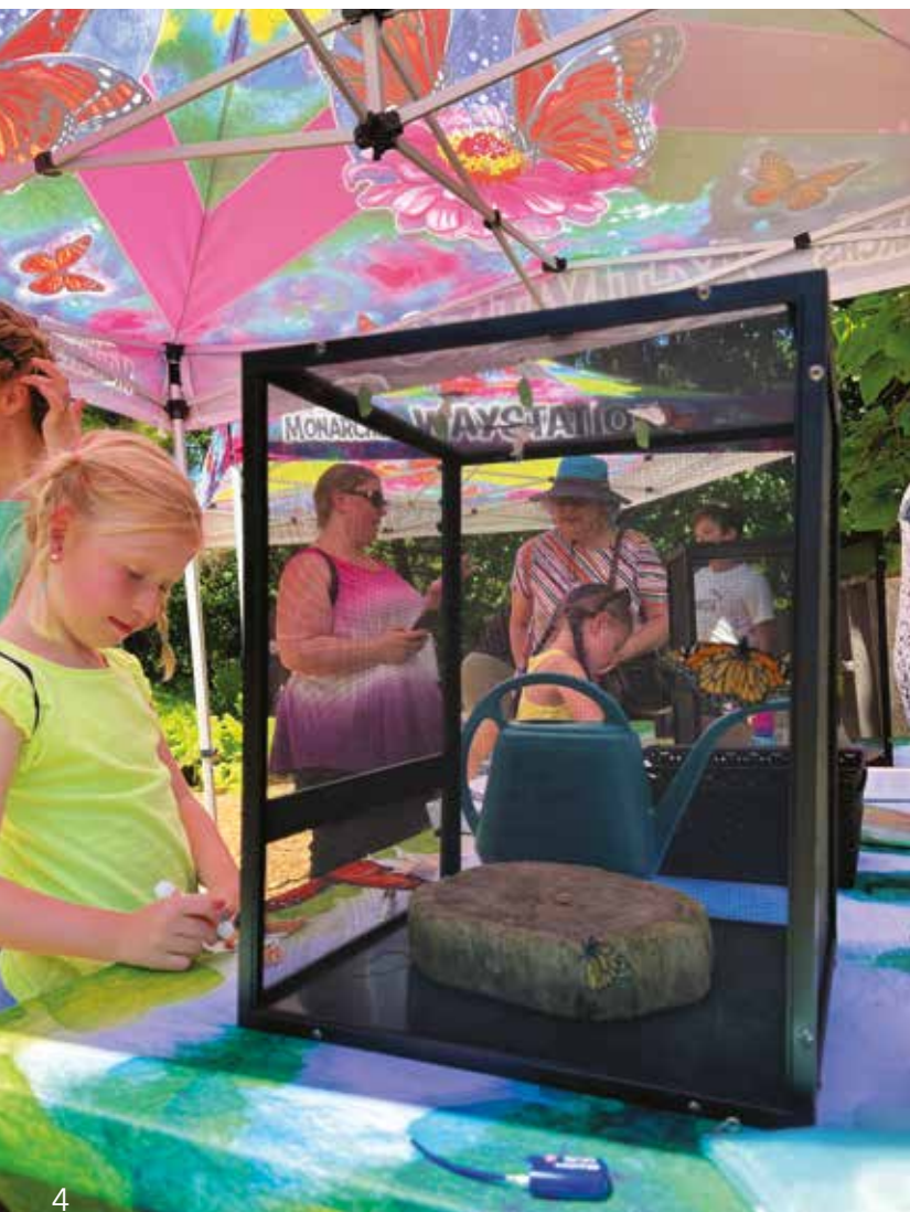
Exhibit Educates Community on Monarch Habitats

The Paine Art Center and Gardens in Oshkosh,